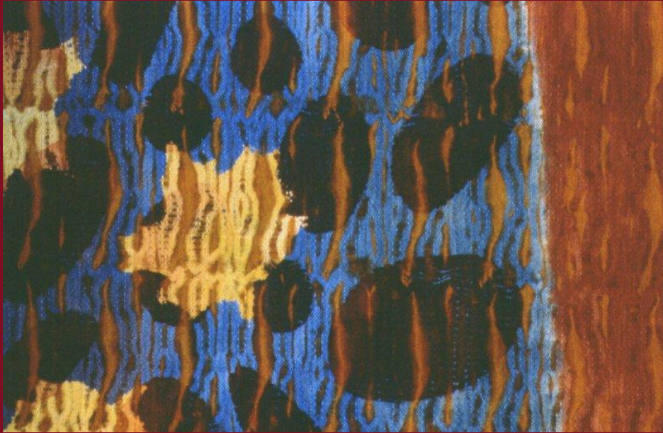
Floating on the Golden River